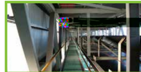
Anti-Slip Aluminium Net