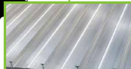
Stiffened Shell Plate