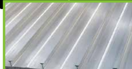
Stiffened Shell Plate