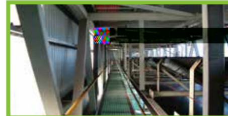
Anti-Slip Aluminium Net